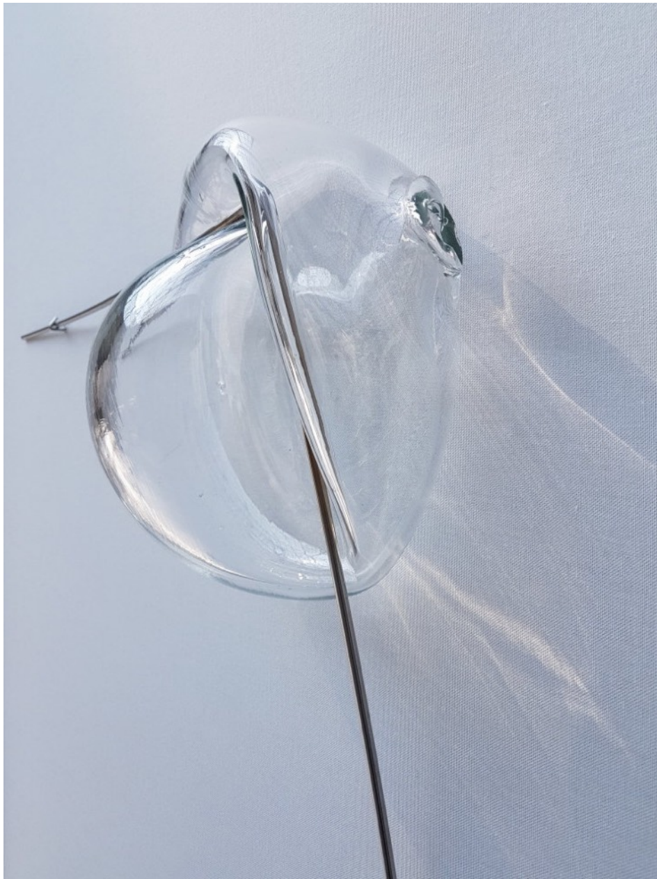
Tulio Pinto Rectangle #4 , 2020 Steel and glass 60 x 60 x 12 cm Edition of 10 (#3/10) € 6,000