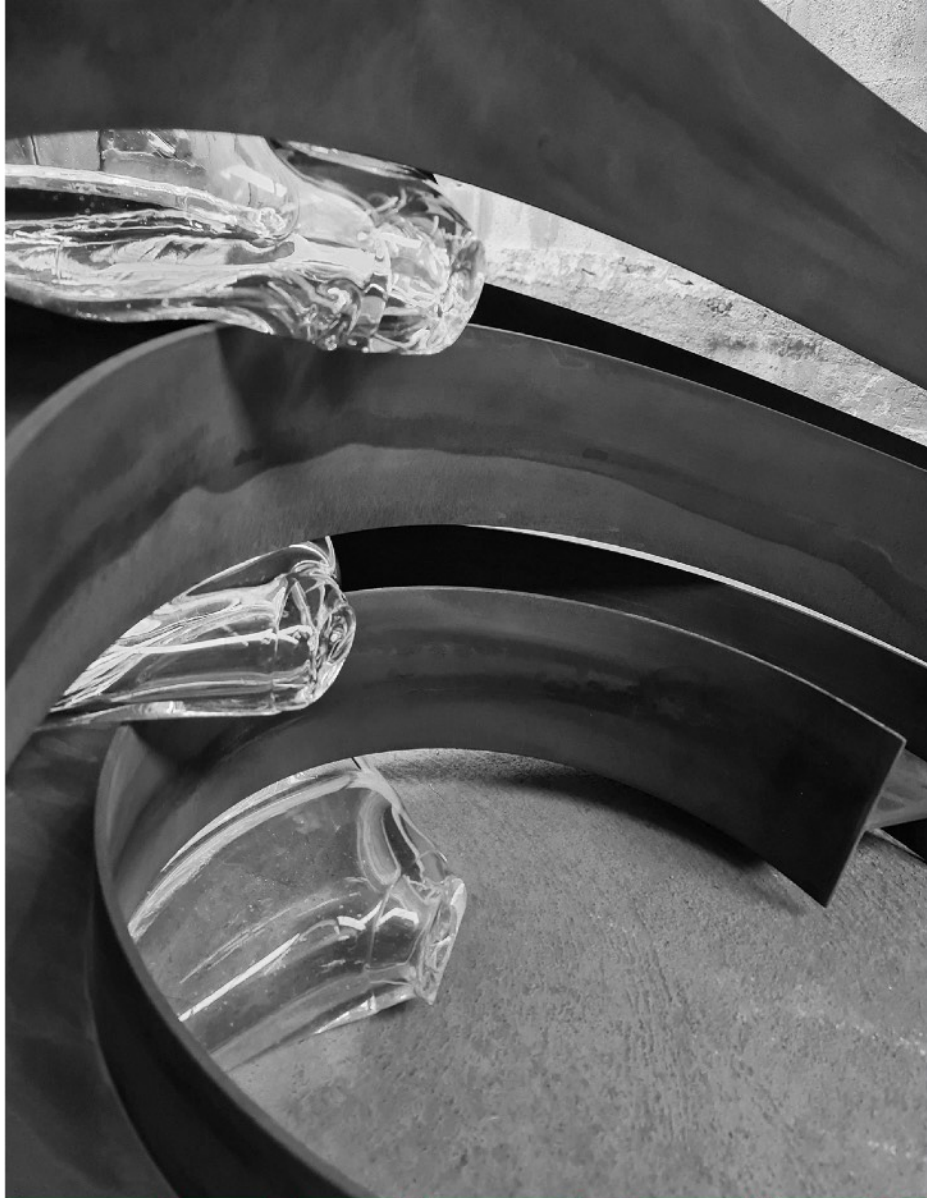
Tulio Pinto “Material Resilience”